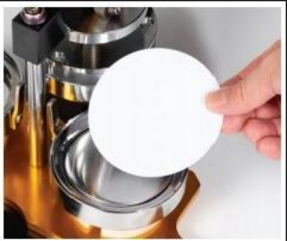
2.Put "Tin up cover"—"Paper" (pattern levelly placed)— "Transparent plastic film" into the right mold in sequence, then anticlockwise revolve the down mold to bottom till the up and down mold aligned