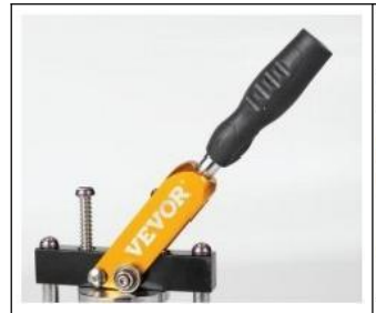
1.Revolve and twist handle in