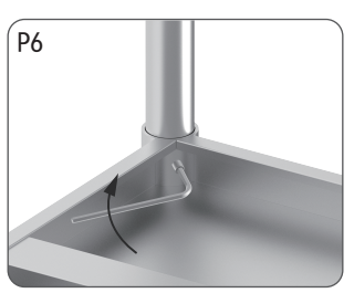
Twist the shelf bolts Torque is greater than or equal to 25 N•m