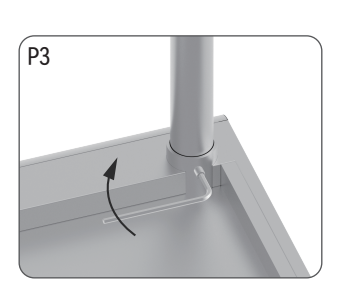
Twist the upper panel bolts