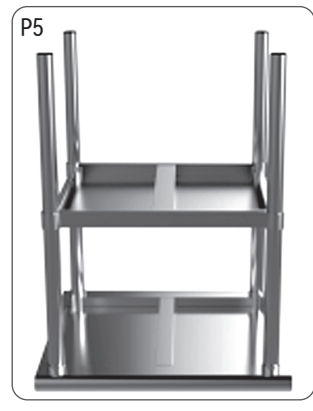
The shelves are placed at the same height according to the drawn line